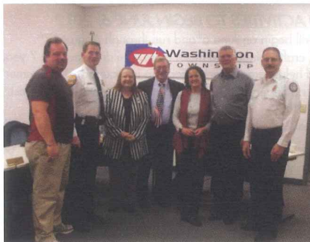
Trustees, Fiscal Officer, and Department Heads at the first meeting of 2012.